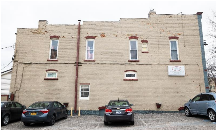
2021 photo of LivCo Walls Caledonia, NY mural site (left)

This regional mural festival concept builds on the quality of place efforts accelerated by the Downtown Partnership, a program of Livingston County Economic Development, grows regional pride, and garnered significant attention and exposure nationally.