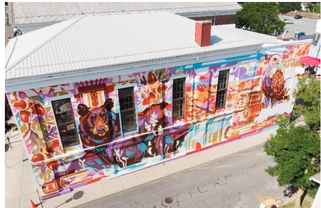
2021 photo of Geneseo, NY LivCo Walls Mural Site, Livingston County | 2022 Key Detail Mural

The 2022 Liv Co Walls mural festival is an innovative project intended to enhance Livingston County’s economic development efforts. This project brought one large mural to each of the nine downtown districts— providing another asset in their walkable, pedestrian-friendly downtowns. These murals attract visitors, locals, and tourists! In July of 2022 regional, national, and international artists created 9 high-quality murals — one in each of the 9 villages of Livingston County. The murals were unveiled on the same month, with celebrations and events taking place all over the county throughout the duration of the festival to recognize the artists and the communities.