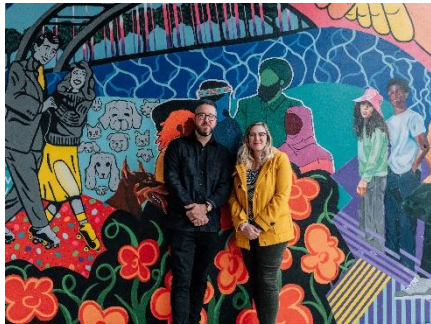
'Unity' mural near The Landing | Fort Wayne, IN