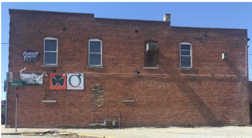
The image above depicts the east façade of 1804 W Main Street, Fort Wayne 46808. The images below depict some of the reference material which the finalist(s) may use to develop the mural design

Public Art Intent and Goal: The project location is the east façade of 1804 W Main Street, Fort Wayne, IN 46808. The goal is to provide a creative installation that will resonate with with neighborhood, and embody and celebrate the Nebraska Neighborhood’s rich history.