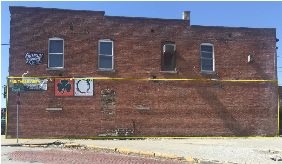
PAINTABLE AREA DIMENSIONS * ~800 SQUARE FEET