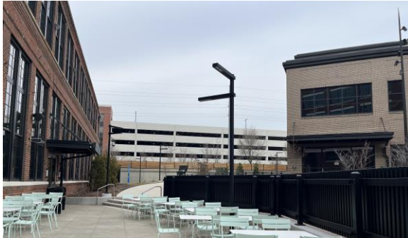
View of garage from the south patio at Union Street Market