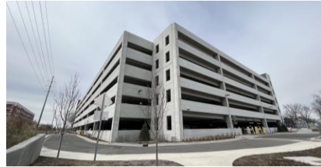
View of garage from the sidewalk along Broadway.