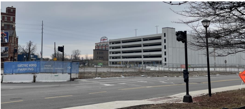
View of garage from the intersection of Broadway and Lavina Street