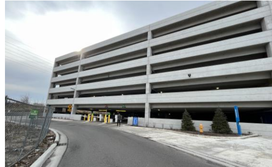
South Elevation of the garage